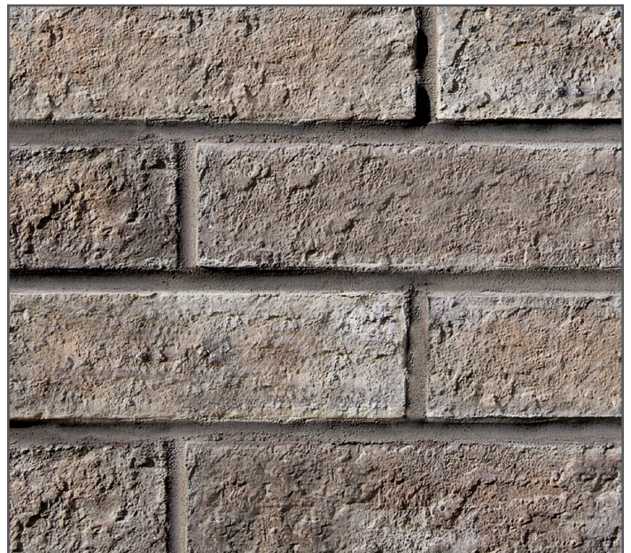
NEW ENGLAND BRICK COLOR: BEAR CREEK